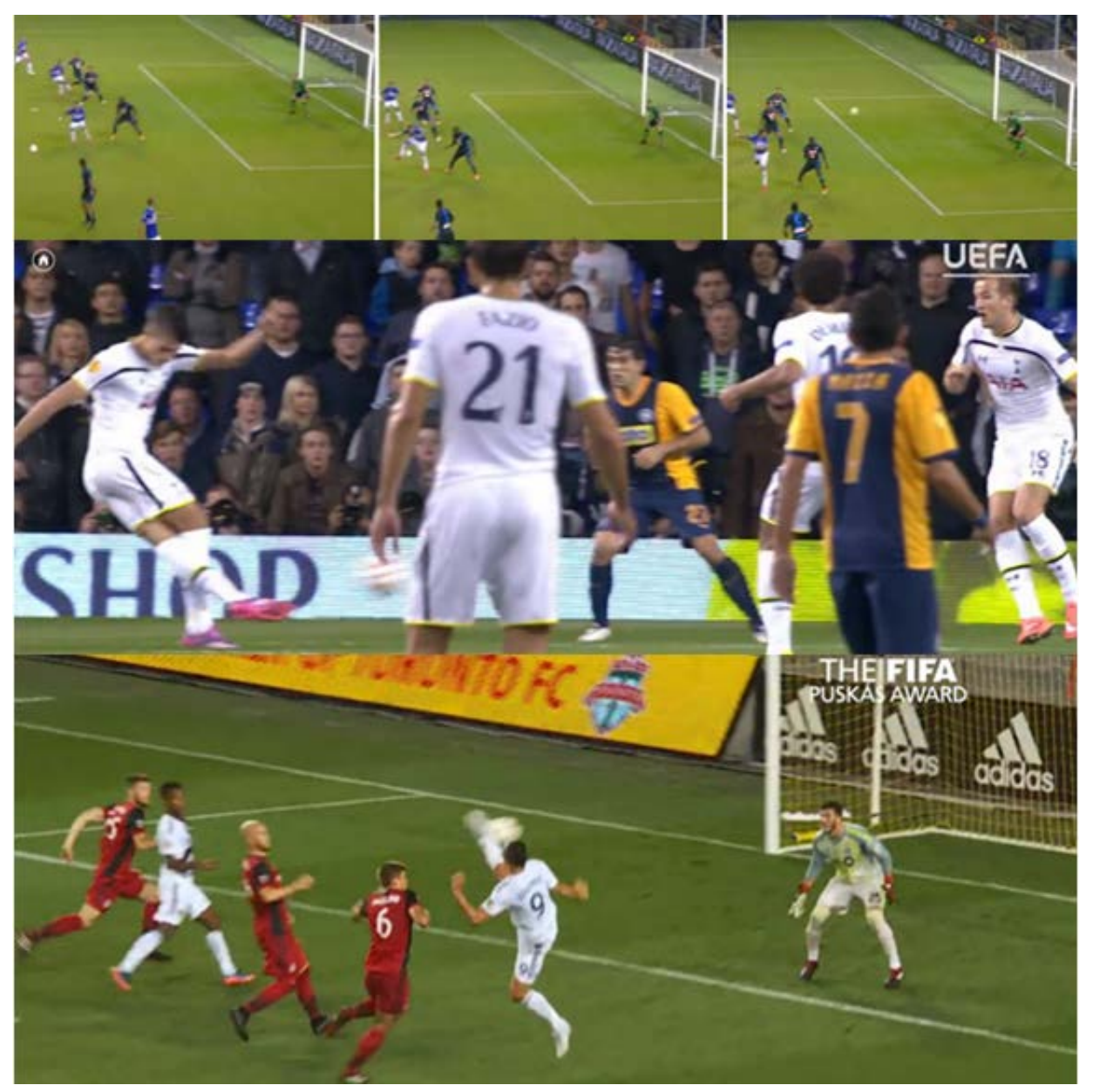
Figure 4. The further breathtaking SSTs innovatively applied by elite athletes: jumping heel rebound (top, from La liga [35]), rabona kick (middle, from UEFA Europa League [34]) and jumping turning kick (bottom, from FIFA Puskás Award [33]).