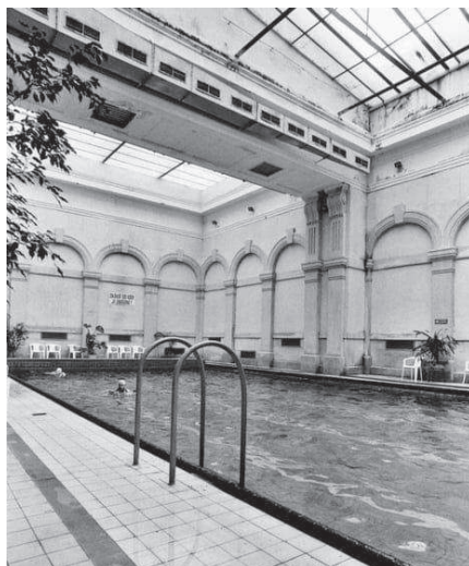
Image 3. The Grössling Swimming Pool in Slovakia