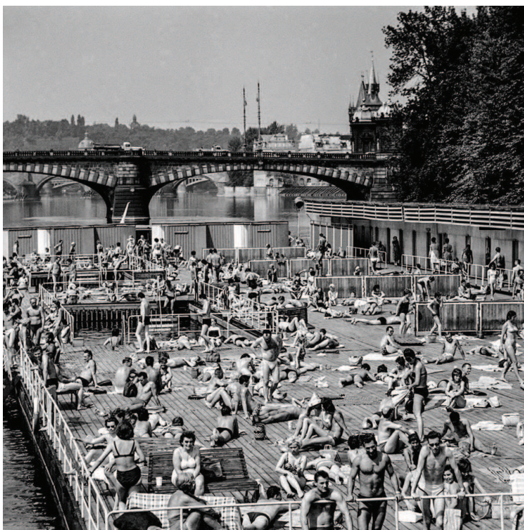
Image 1. The Slovanka swimming pool on the Vltava river

During the inter-war period, many natural, popular and often frequented swimming pools and river springs were established in Czechoslovakia. Among the most famous was the aforementioned swimming complex in Barrandov, Prague, opened in August 1930. There were also many riverside swimming pools in Prague, such as Žluté lázně in Prague's Podolí which was opened in 1910, the Na Mlýnka Spa, the Ponton Spa in Žofín and the Civic Swimming Pool in Klárovo. A large number of natural swimming pools were also open to the public in the vicinity of Prague and other towns in Bohemia and Moravia.