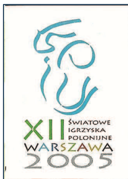
Photo 17. The badge of the 12 th WPG. Warsaw 2005.

In the 11 th World Polonia Games in Poznań (July 26 through August 2, 2003) about 700 athletes participated, including teams from China and Croatia. The athletes competed in 16 sports disciplines: bowling, golf, cycling MTB, basketball, athletics, soccer, swimming, ringo, volleyball, beach volleyball, dragon boats, shooting, family tournament, tennis, table tennis and fishing 25 .