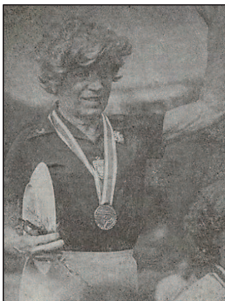
Photo 9. The 3rd Polonia Sports Games in Kraków (1977). Stanisława Walasiewicz-Olson (66 years old) on the podium.

Source: “Biuletyn PKOl” 1981, No. 2, p. 1.