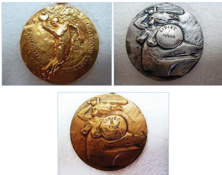
Photo 12, 13, 14. The set of medals for the 5 th Polonia Sports Games in the Jubilee Year: the 50 th anniversary of the Polonia Sports Games and the 40 th anniversary of the Polish People's Republic (Warsaw 1984)

greatest achievements in the 5th PSG were recorded by competitors from Czechoslovakia. Good results were obtained also by athletes from West Germany and France, who were followed by contestants from Belgium, the USA and the Netherlands 17 .