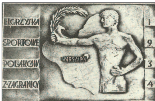
Photo 5. The badge of the 1 st Polonia Sports Games held in Warsaw in 1934

Sports Games should be organized in 1937 in Warsaw 9 . However, deteriorating conditions inside the country and the growing external threat related to preparations for the war resulted in postponement of the date of the Games at the requests of some Polonia communities to the following years, until they were finally canceled 10 .