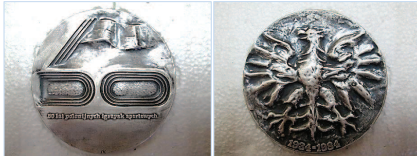
Photo 15, 16. Commemorative medallion (obverse and reverse) of the 5 th Polonia Sports Games in the Jubilee Year: the 50 th anniversary of the Polonia Sports Games and the 40 th anniversary of the Polish People's Republic (Warsaw 1984)