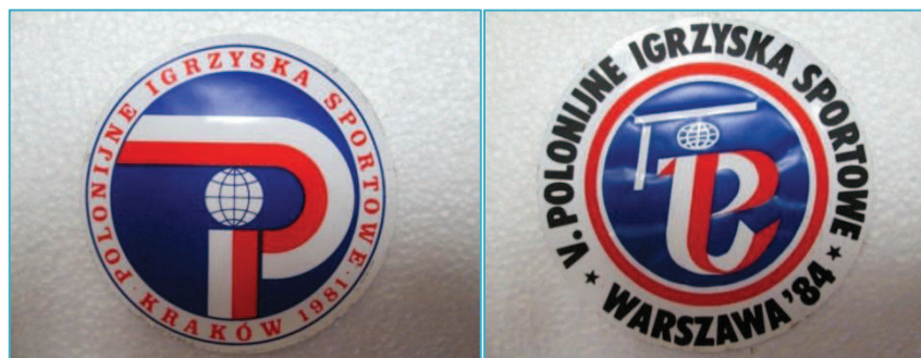
Photo10, 11. The 4 th Polonia Sports Games in Kraków (1981); the 5 th Polonia Sports Games in Warsaw (1984)

The 4th Polonia Sports Games were once again held in Kraków on July 15–19, 1981. The economic crisis and sociopolitical unrest in Poland contributed to lower attendance. Some Polonia centers were represented by very few competitors, and Canadians did not send a team at all. The Games were attended by 383 athletes from 12 countries, and the lower turnout resulted in a marked decline in the sports level.