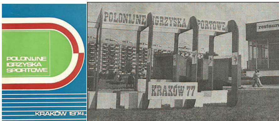
Photo 6, 7. The 2nd Polonia Sports Games in Kraków (1974) and the 3rd Polonia Sports Games in Kraków (1977), [in:] "Biuletyn PKOl" 1980, No. 9, p. 25