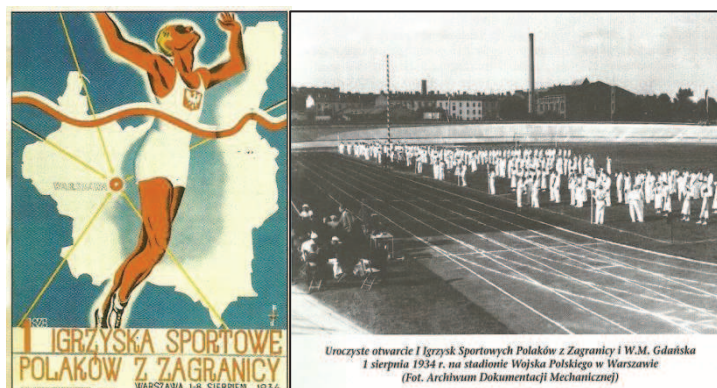
Photo 2, 3. The poster for the 1 st Sports Games for Poles from Abroad and the Free City of Gdańsk and the Games' opening ceremony on August 1, 1934, in the Polish Army Stadium in Warsaw

At its 5th General Assembly in November 1933, the Organizational Council of Poles from Abroad passed a resolution to hold the 1 st Sports Games for Poles from Abroad and the Free City of Gdańsk during the 2 nd Congress of Poles from Abroad in early August 1934 in Warsaw. In order to implement the above resolution, the Organizing Committee was appointed, with the Presidium composed of Władysław Raczkiewicz (Speaker of the Senate, President of the Organizational Council of Poles from Abroad), Władysław Kiliński (Director of the State Office of Physical Education and Military Preparation), Julian Ulrych (President of the Union of Polish Sport Associations) and Kazimierz Glabisz (President of the Polish Olympic Committee) 6 . 381 athletes (348 men and 33 women) from 13 countries participated in the Games, representing an about 70 thousand strong group of Polonia athletes from around the world 7 .