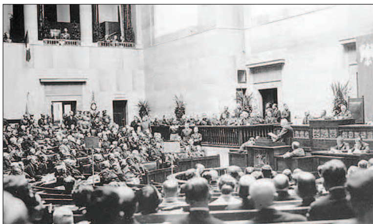
Photo 1. The venue of the 1 st Congress of Poles from Abroad and the Free City of Gdańsk in July of 1929 in Warsaw

Establishment and development of Polish organizations in foreign countries was extremely important to preserve Polish national identity. For this purpose, the Organizational Council of Poles from Abroad, based in Warsaw, was established at the 1 st Congress of Poles from Abroad and the Free City of Gdańsk in July of 1929 4 . The patrons of the Congress were President Ignacy Mościcki, Marshal Józef Piłsudski and Primate August Hlond. The proceedings, with the participation of 97 delegates from 18 countries and visitors from Gdańsk, were held in the Sejm 5 .